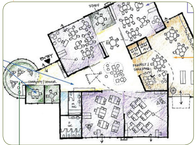
21C Library and Learning Neighbourhood - Building the Education Revolution from Victorian Department of Education and Early Childhood Development